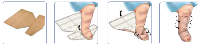
Fig 1. Application of the Eclypse® Boot

From the product description, this dressing seems the ideal choice to manage the fluid from 'leaky legs'.